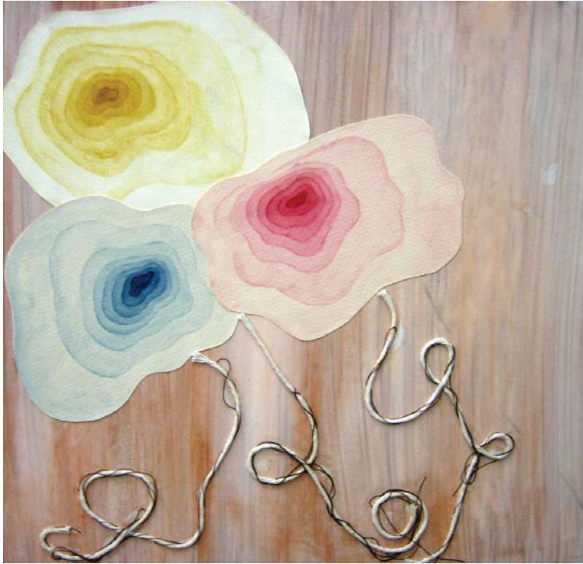
Talyah Sands intertwined