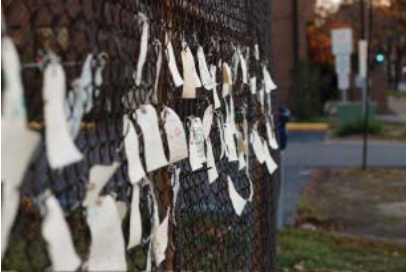
Brian Surguine school 5