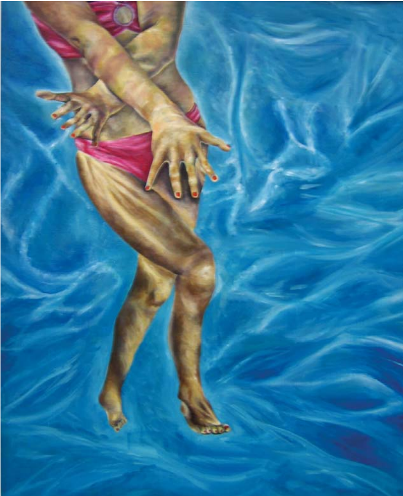
Talyah Sands sink or swim