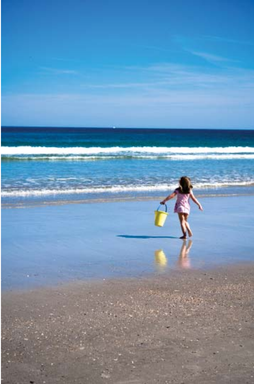
Brian Surguine Girl at Jax Beach