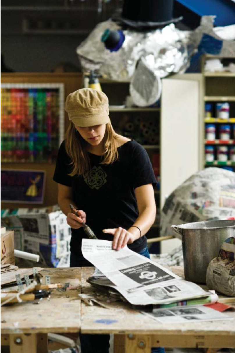
Festifools photos taken by Myra Klarman.