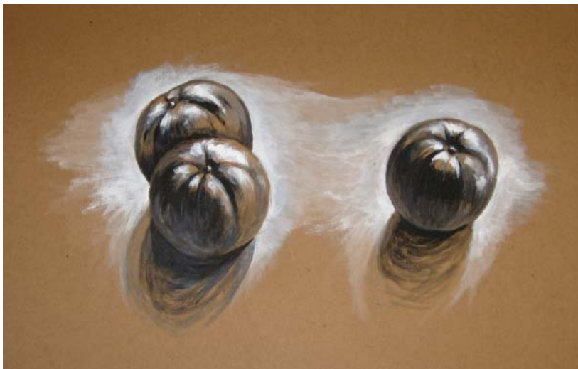
Olivia Su Orange Study