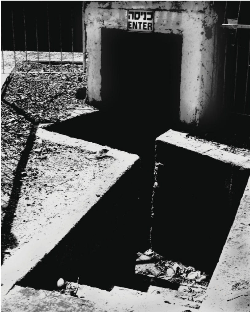
Beth Wittenstein black & white